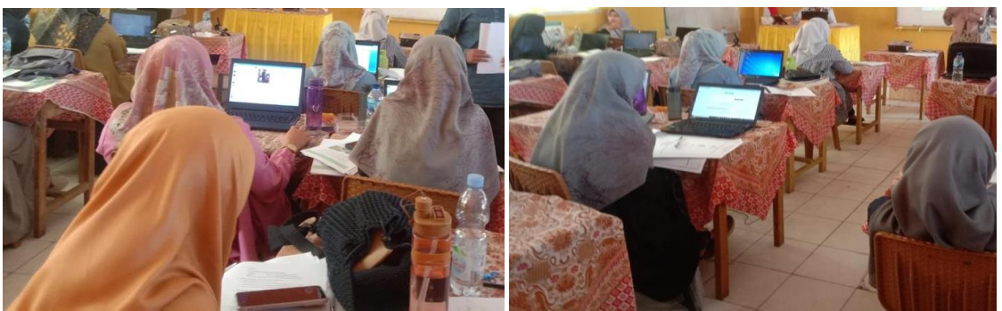
Figure 1. Activities

In this activity the teachers were very enthusiastic about participating in the training. When the material started about using the Mendeley application in writing bibliography and citing the teachers were very focused on paying attention. Indicators can be seen from the 20 teachers who took part in the Mendeley training, 17 teachers seemed to pay attention to the material presented by the resource person. This is because they have never used Mendeley in citing or writing a bibliography. The Mendeley application makes it easier for writers to manage bibliography lists (Cahnia et al., 2021). Then the teachers looked enthusiastic in installing the Mendeley application. Then use it in citing using Google Scholar. First, the team taught how to download the Mendeley application, then install it. Second, enter a list of books and journals for literacy both manually and online. Third, quoting using Mendeley in writing. Fourth, insert a bibliography automatically from the quotation results. Mendeley can manage bibliography lists directly connected to Google Scholar. Using the Mendeley application can increase participants' knowledge and skills in writing scientific papers.